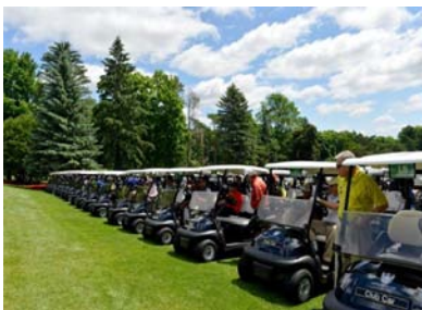
Ready, Set, Golf!