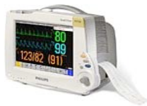
A physiological monitor is used to monitor different parameters such as

As the new MCH comes to life at the Glen Campus, JFK'S Operation Suite Tomorrow campaign will focus over the course of the next three years on both The Children's current and future needs. This year, our goal is to raise a total of $420,000. With the focus in medicine turning towards Ambulatory Care, there is a great current need to update the MCH's Pediatric Day Hospital with state-of-the-art medical equipment which will be put to use in both the current and the new MCH . The equipment for the Day Hospital will cost approximately $170,000 and will consist of many different pieces of equipment. (Partial list follows.) This will provide high quality ambulatory care and will decrease hospitalization. The balance ($250,000) will be directed to our ongoing campaign for The Children's future needs to purchase state-of-the-art equipment for the Operating Suite at the new MCH to be known as the JFK Operating Room Suite.