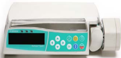
Syringe Pumps – Medication Delivery