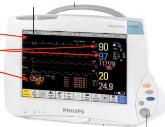
For the 6C department, the unit has to be mobile