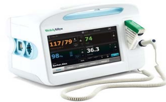
Vital Signs Monitor